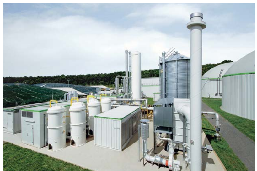
Processing plant for biomethane production installed in standard, space-saving containers