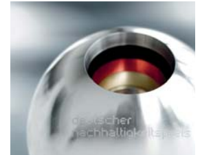
2009/2011/2013: German Sustainability Award for Production/Brand/Resource Efficiency

The long term goal is for the company to meet all its own heating energy requirements by sustainable means.