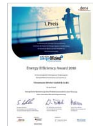
Energy Efficiency Award 2010