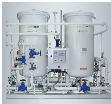
Units for hydrogen (above) and nitrogen generation are designed and built by Carbotech on the basis of individual application requirements.